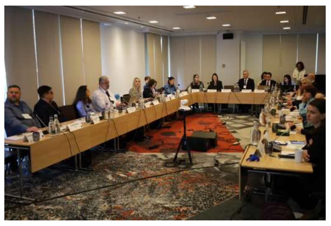
Figure 3 5th Operational Network of Funders Meeting on 04 May 2023 in Brussels