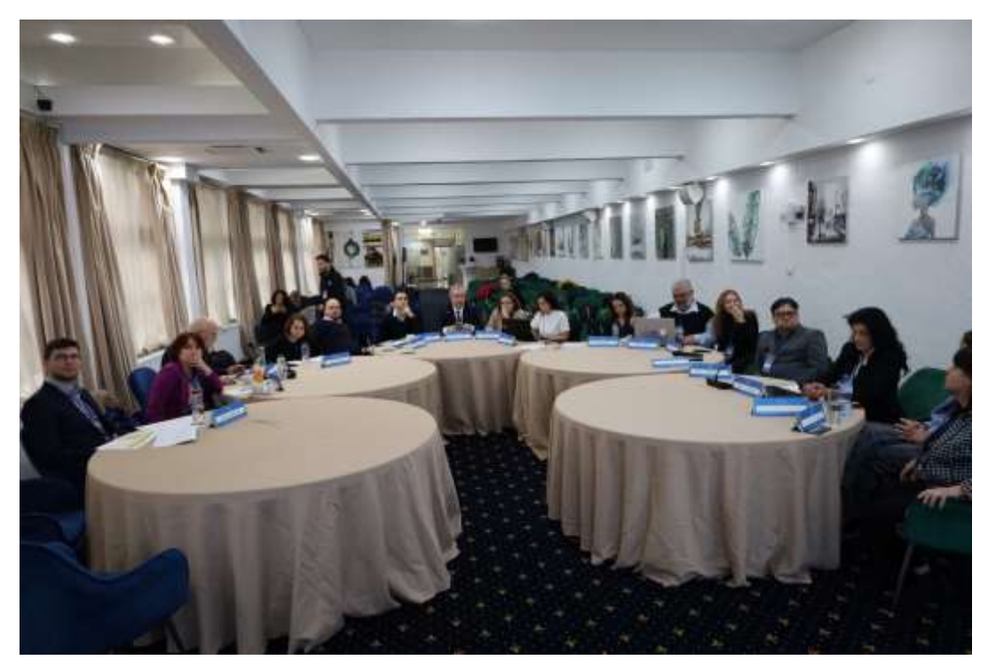
Figure 2. 4th Operational Network of Funders Meeting on 16 March 2023 in Bucharest