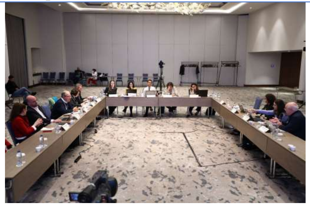
Figure 1. 3rd Operational Network of Funders Meeting on 12 November 2022 in Istanbul